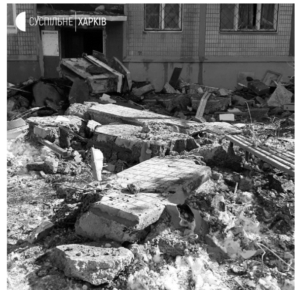
Suspilne Kharkiv. (n.d.). Home [Facebook page]. Facebook. Retrieved March 25, 2022, from https://www.facebook.com/suspilne.kharkiv