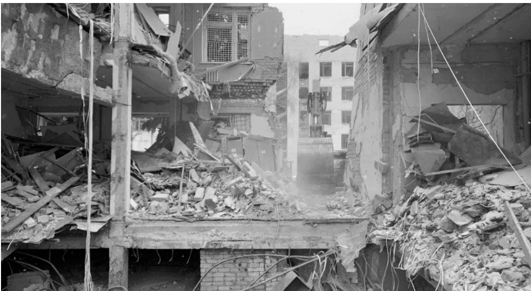
(the 1 st and 2 nd photos on the page)