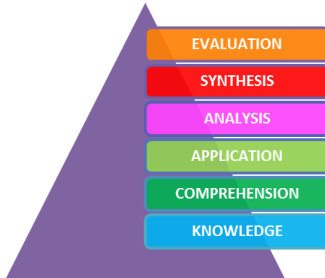
Bloom B. S (1956) A Taxonomy of Educational Objectives

Figure 2 demonstrates the revised version of Bloom’s Taxonomy proposed by David Krathwohl and Lorin Anderson in 2000.